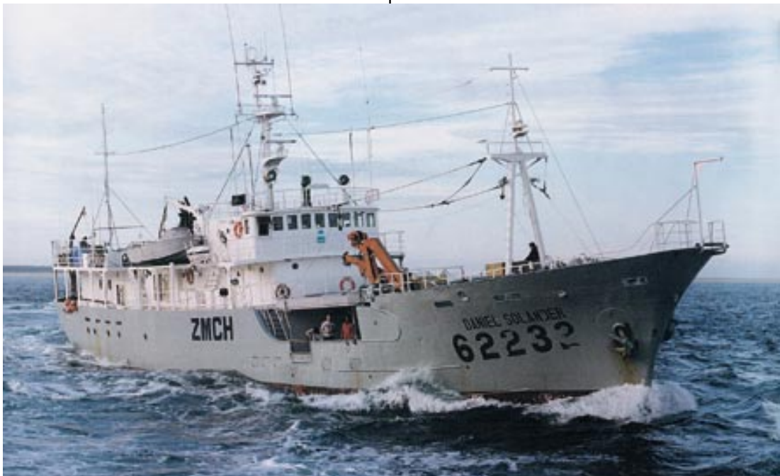
The Daniel Solander has an almost legendary status in the industry regarding its seabird by-catch record.

"It's a challenge to find the solutions," says Tom. "There've been some good ideas. All you need to cover is the 300 metres behind the boat and 10 metres on either side of it."