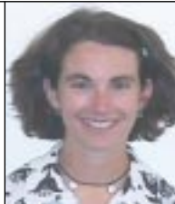
ALEX EDGAR / NZ MINISTRY OF FISHERIES